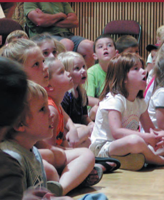
Children were mesmerized at a magic show performed at the Library.